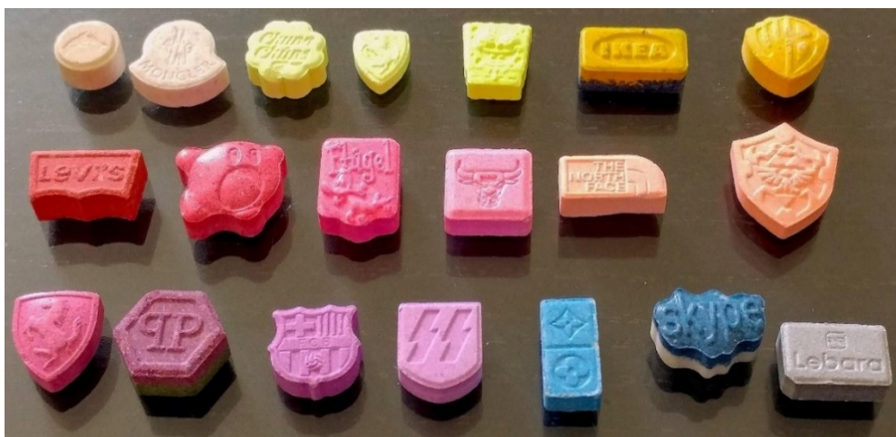
Figure 2: Ecstasy tablets with several logos, such as Warner Bros in the top right corner and Ferrari in the bottom left corner.

Vendor names also exploit the names of well-known brands and companies. The data contain 39 (5.0%) examples of these names, such as cocacola-crew , Dream_Works , LAMBORGHINI2 , MonsterEnergyDrugs , starbucks101 and TESCOEXPRESS . Some brands are tightly connected to a country or known mainly on a national level ( AlbertHeijn , CzechAirlines , deBijenkorf , NORWEGIANcom 9 ) and thus make an indirect reference to the vendor's home country. Naturally, this type of unauthorised use of brands to gain financial benefit is a copyright violation, even though it would seem like a minor offense when compared to producing and distributing a vast amount of illegal drugs. As vendor names are not visible to a large audience, the damage caused to the reputation of brands and companies most likely remains small.